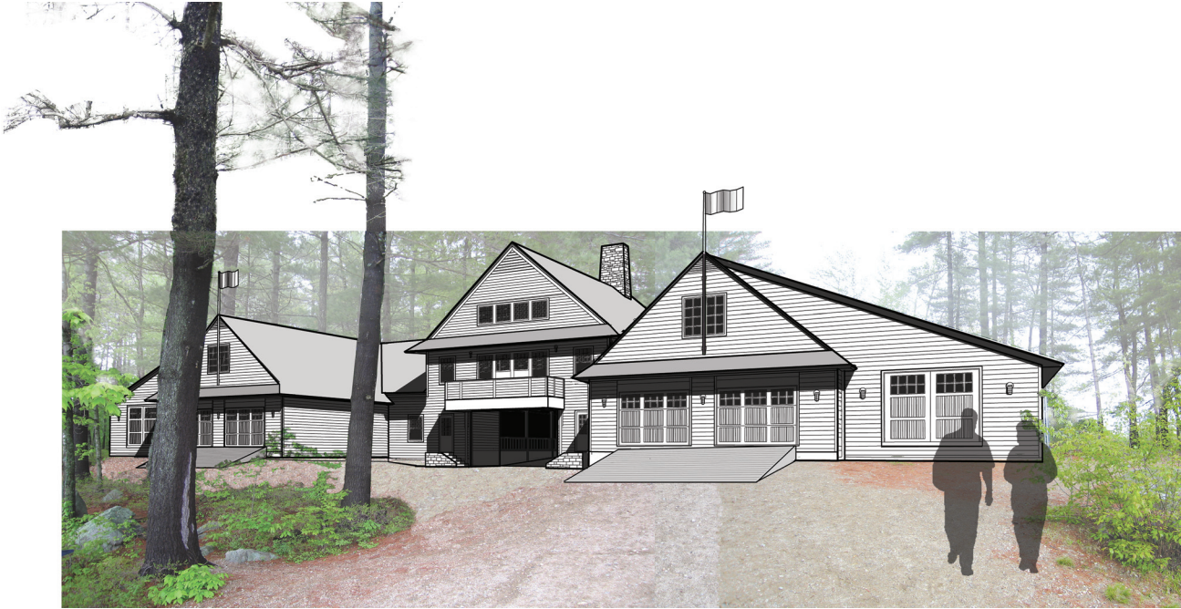
View From Pond