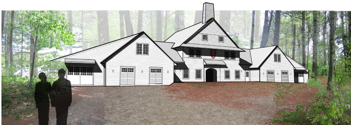
View From Shore